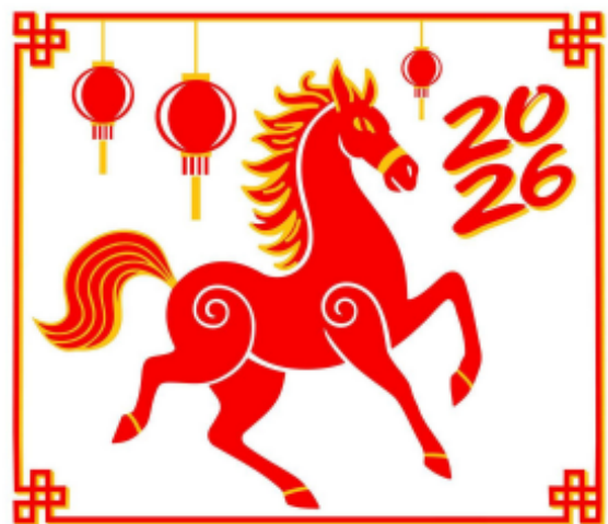
Chinese New Year - Year of the Horse February 17th